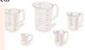
Bouncer® Measuring Cups