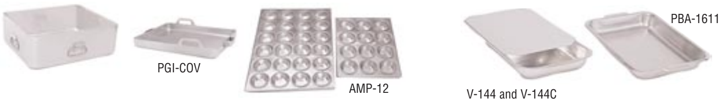
V-144 and V-144C