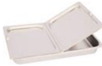
Flat Hinged Cover