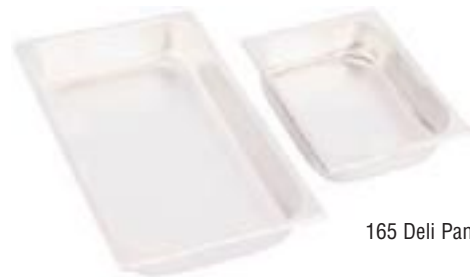
165 Deli Pans